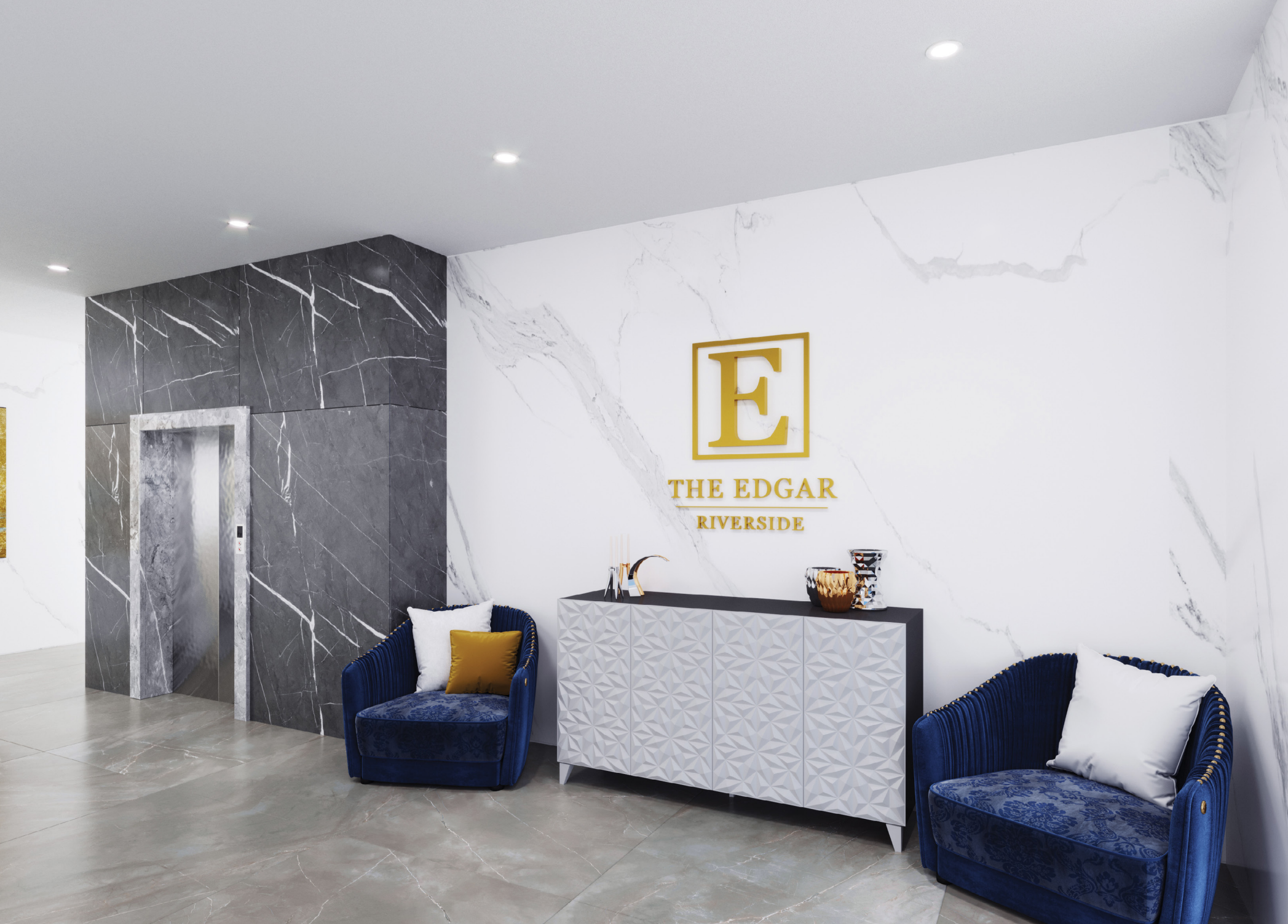
FIRST FLOOR LOBBY - ARTISTIC RENDERING