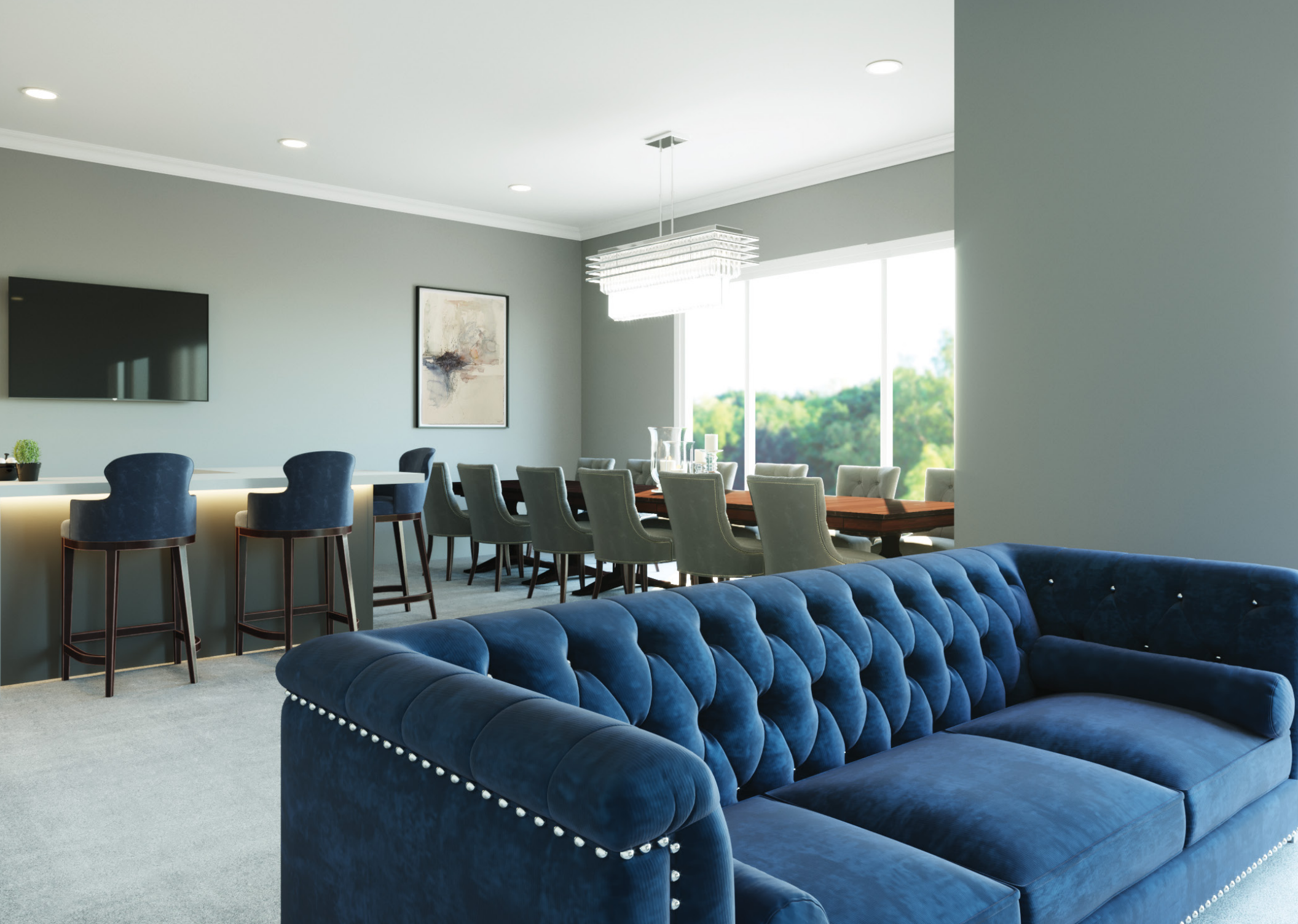
SECOND FLOOR LOUNGE, ENTERTAINING ROOM - ARTISTIC RENDERING

We know our discerning clientele seek more than just a beautiful suite. Our client-centric philosophy ensures your new home will offer you a lifestyle of enjoyment. We pride ourselves on providing impeccable amenities. Enjoy a healthy and relaxing lifestyle at The Edgar.