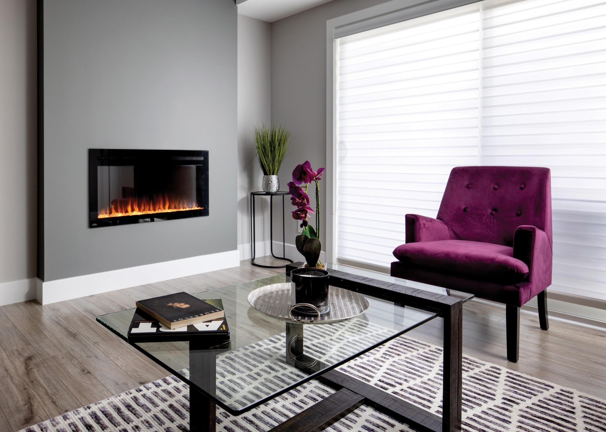
PREVIOUS PROJECT - THE FAIRVIEW