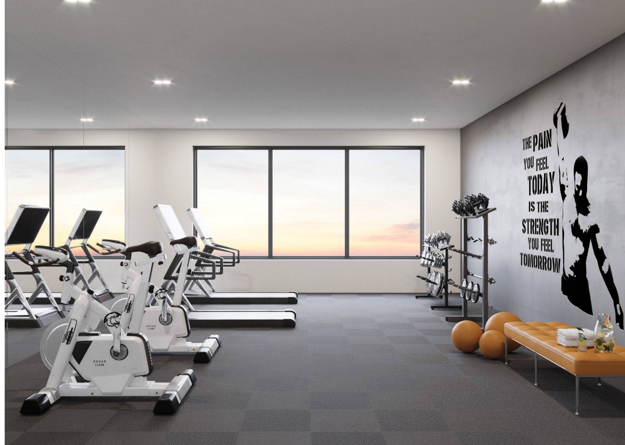
FITNESS CENTRE - ARTISTIC RENDERING