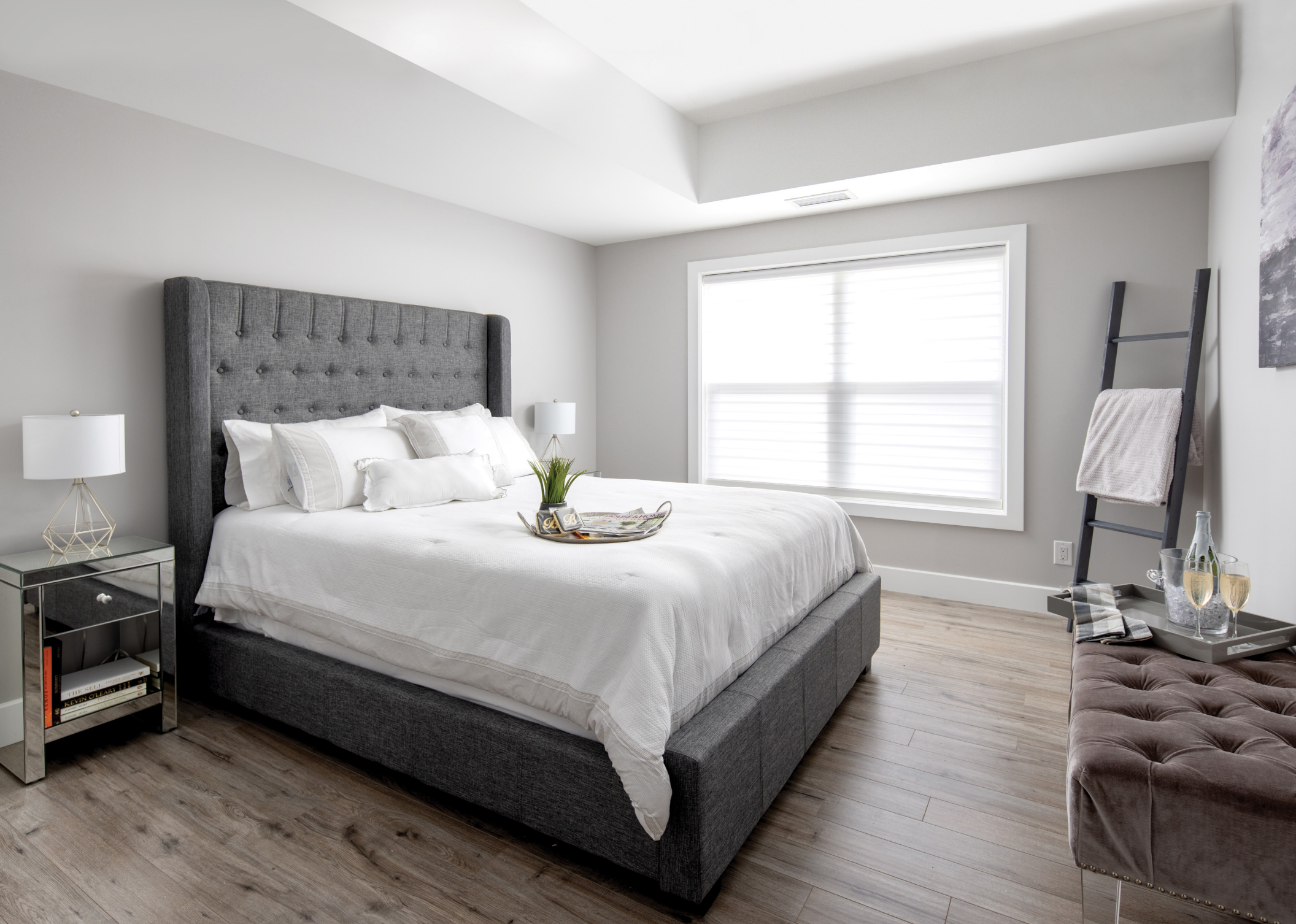
PREVIOUS PROJECT - THE FAIRVIEW