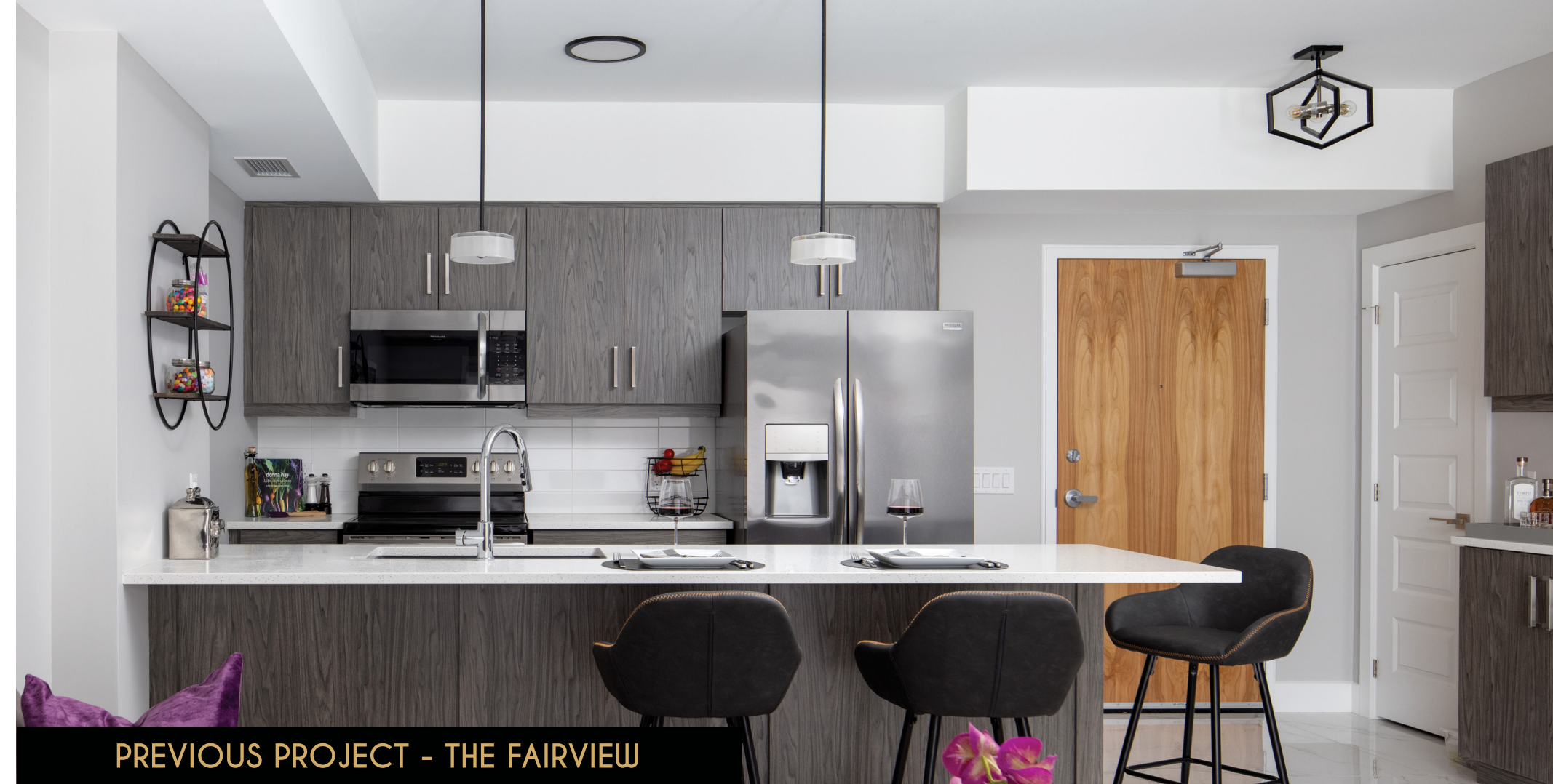
PREVIOUS PROJECT - THE FAIRVIEW

Spacious open-concept suites which are designed for entertaining or everyday living, feature chef-inspired kitchens, perfectly paired with modern cabinetry, hard surface counter tops, stainless steel appliances and elegant lighting.