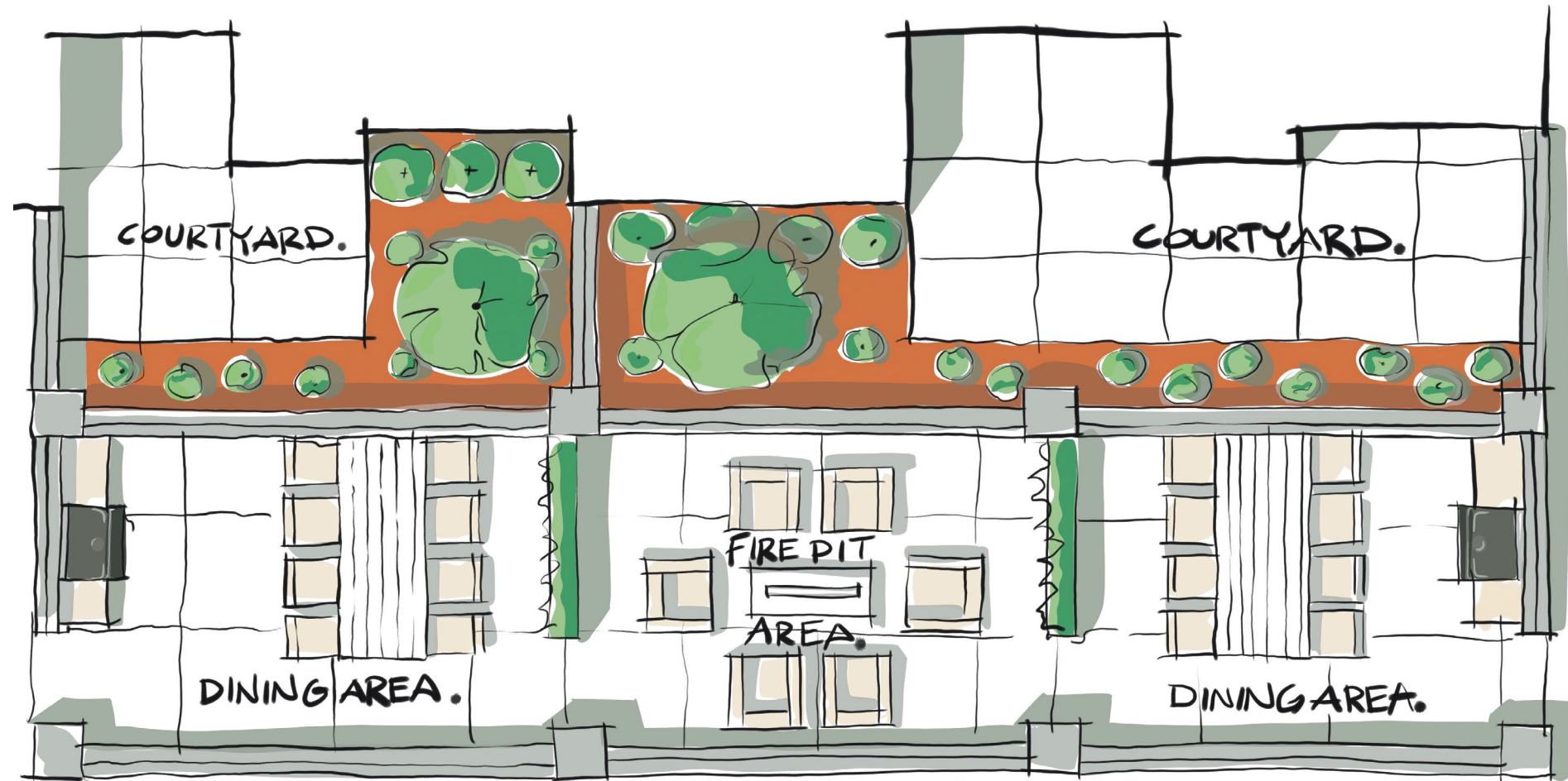
OUTDOOR COMMON COURTYARD