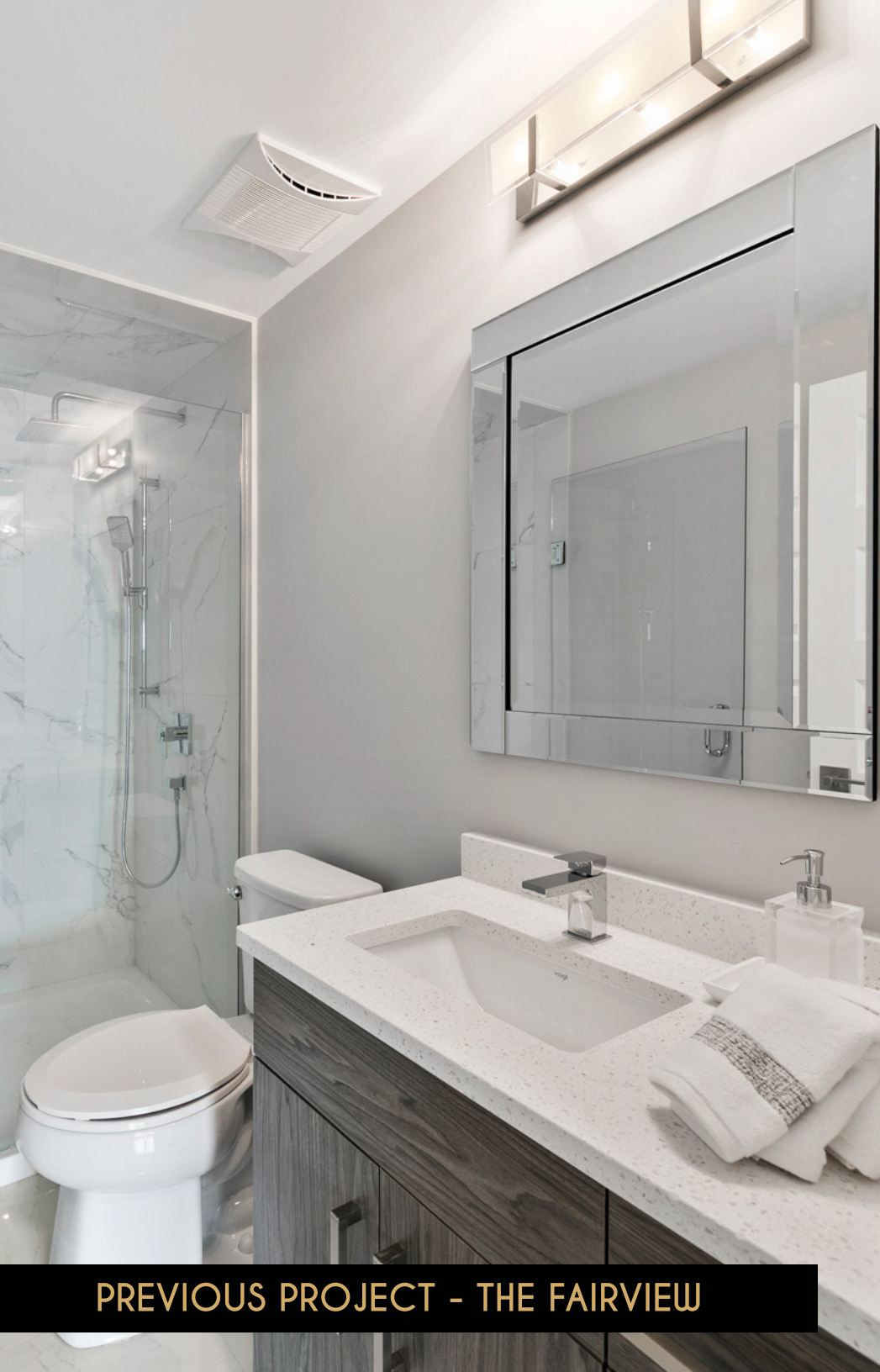
PREVIOUS PROJECT - THE FAIRVIEW